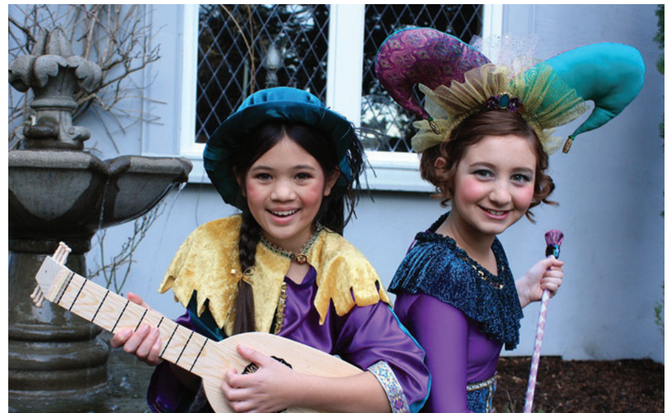
A pair of young bards prepare to entertain.