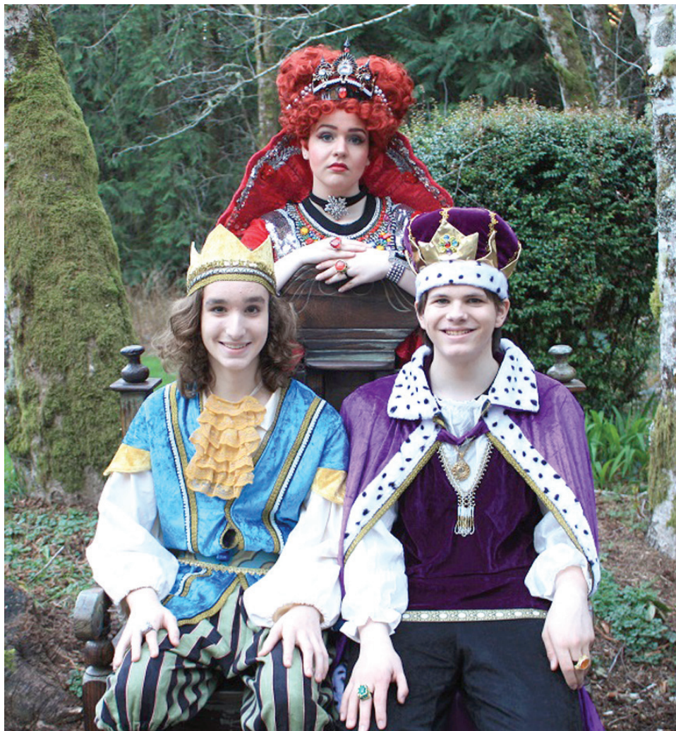
Queen Aggravain, Prince Dauntless and Sir Harry