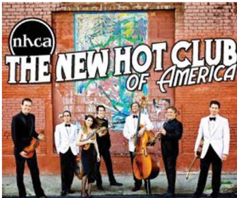
The New Hot Club of America