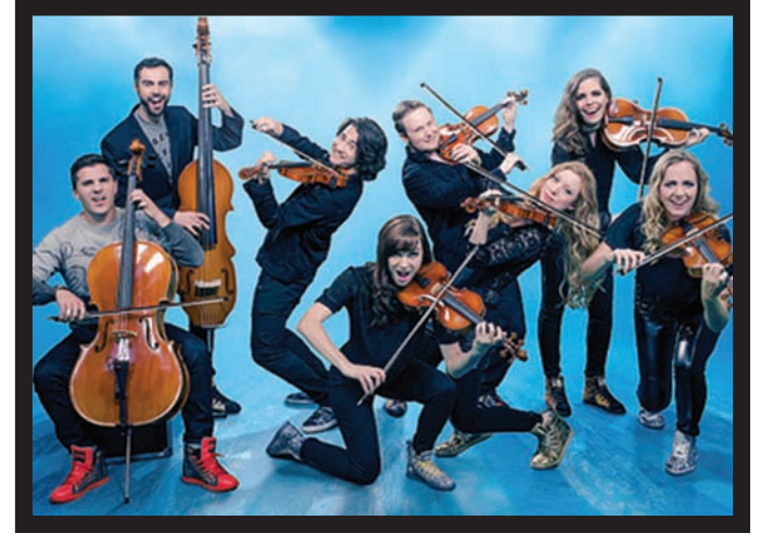
FROM LEFT: "DALLAS BRASS" (MARCH 29); "PINK MARTINI" (NOV. 18); AND "BARRAGE 8" (APRIL 26)