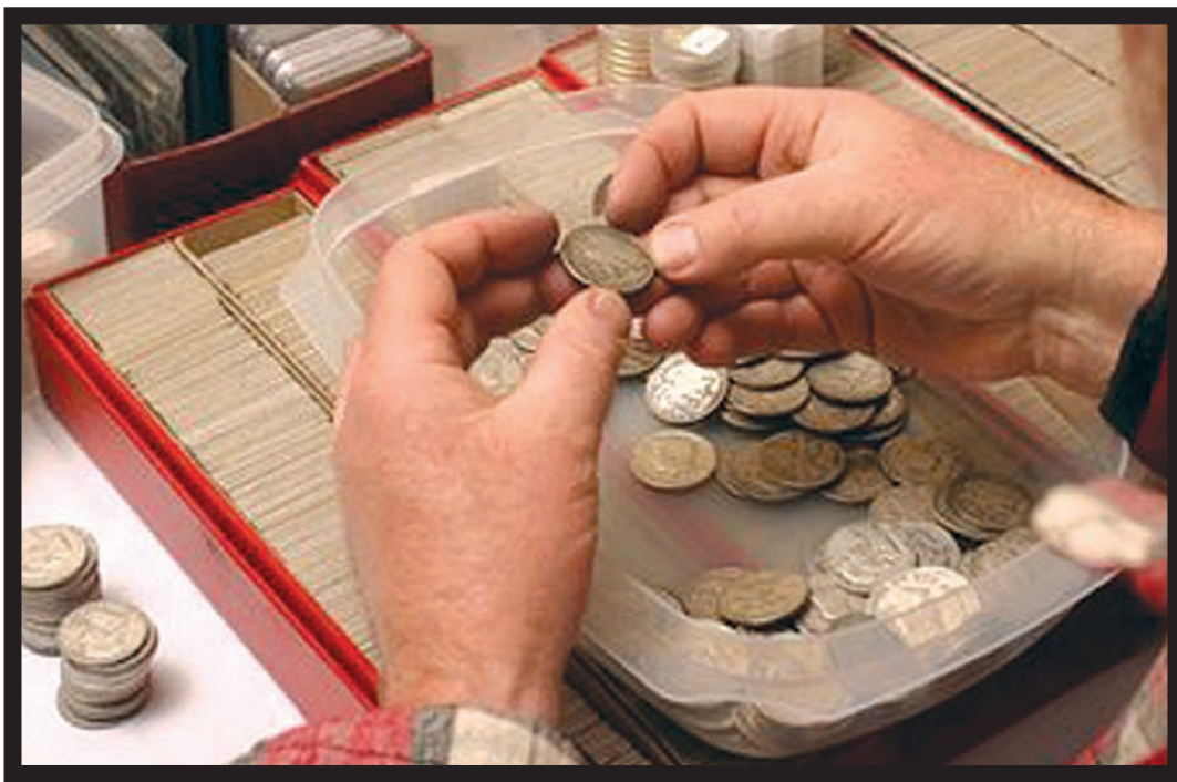
COINS CAN BE IDENTIFIED, APPRAISED AND COLLECTED AT THE 19TH ANNUAL EVENT.

than later. This will allow plenty of time to look at all the exhibits and talk with dealers.